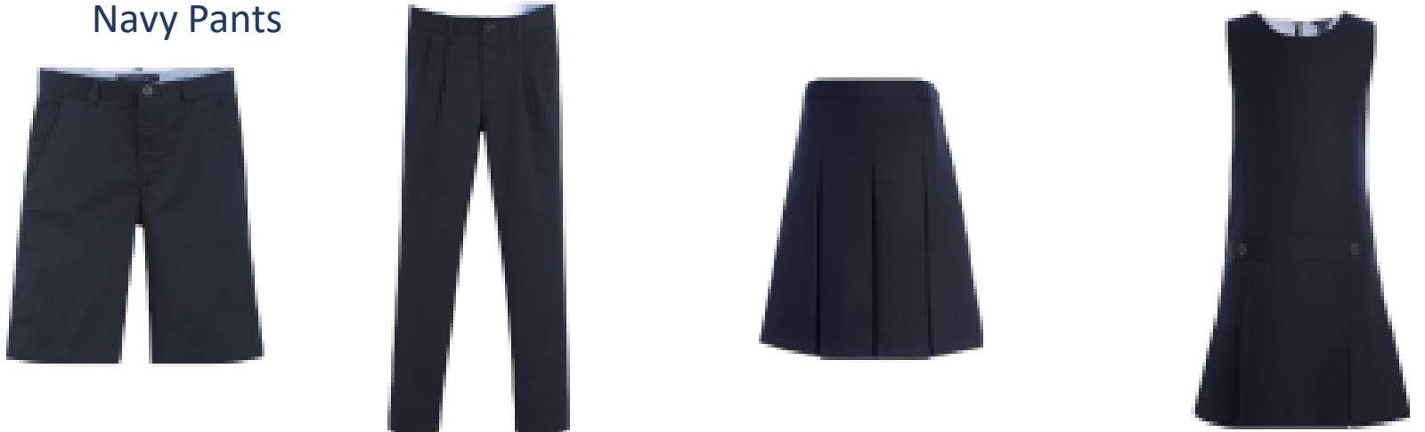
Navy Jumpers may be worn in combination with white top.