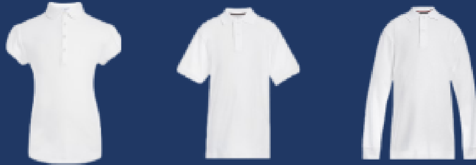
Daily Uniform Tops: White Button-Down or White Polo Shirts